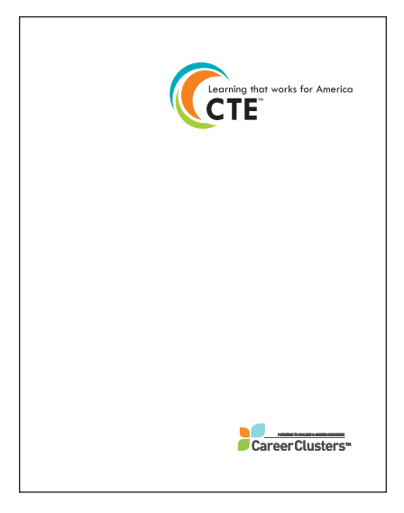
Figure 19. Fact sheet with CTE brand in the prominent position (emphasis on the brand) with Career Clusters in a secondary position.

It is important to provide adequate space for the CTE logo/signature to ensure the brand remains clearly distinguishable and uncluttered. As a rule, no other copy should be placed within a "brand letter" height of any portion the signature. (see Figure 21)