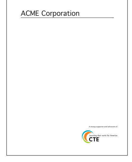
Figure 5. Sample letterhead showing relationship between corporate logo and CTE brand.